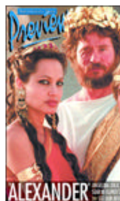
Arts & Entertainment Magazine